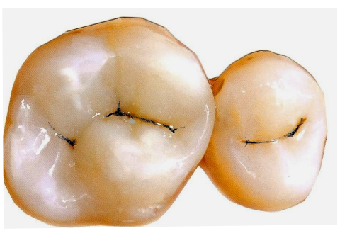
Pits are weak and vulnerable. Sealing can prevent decay by keeping out the plaque and rehardening the enamel.

There are multiple benefits. Obviously plaque is sealed out so that acids can not attack the surface. In addition sealants raise the pH to neutralise